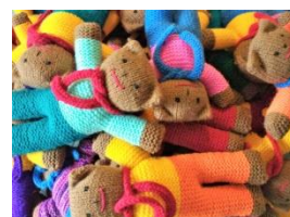
Love bears for the children in Mexico!!