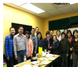
Sharing at TJCAC mission prayer meeting.