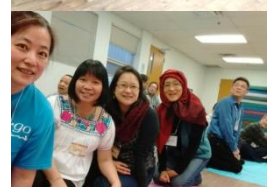
Journey with others in Kairos.