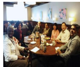
Lunch with leaders from Sheridan Park AC